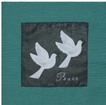
Sabeel Peace Tapestry 2008 - International