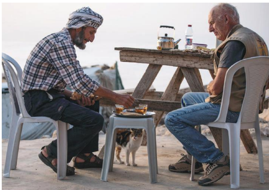
Sharing breakfast, South Hebron Hills

In addition to the Executive Committee, FoSN operates with a Steering Group that consists of approximately ten women and men from across the country. FoSN also works to mobilize young leadership, and