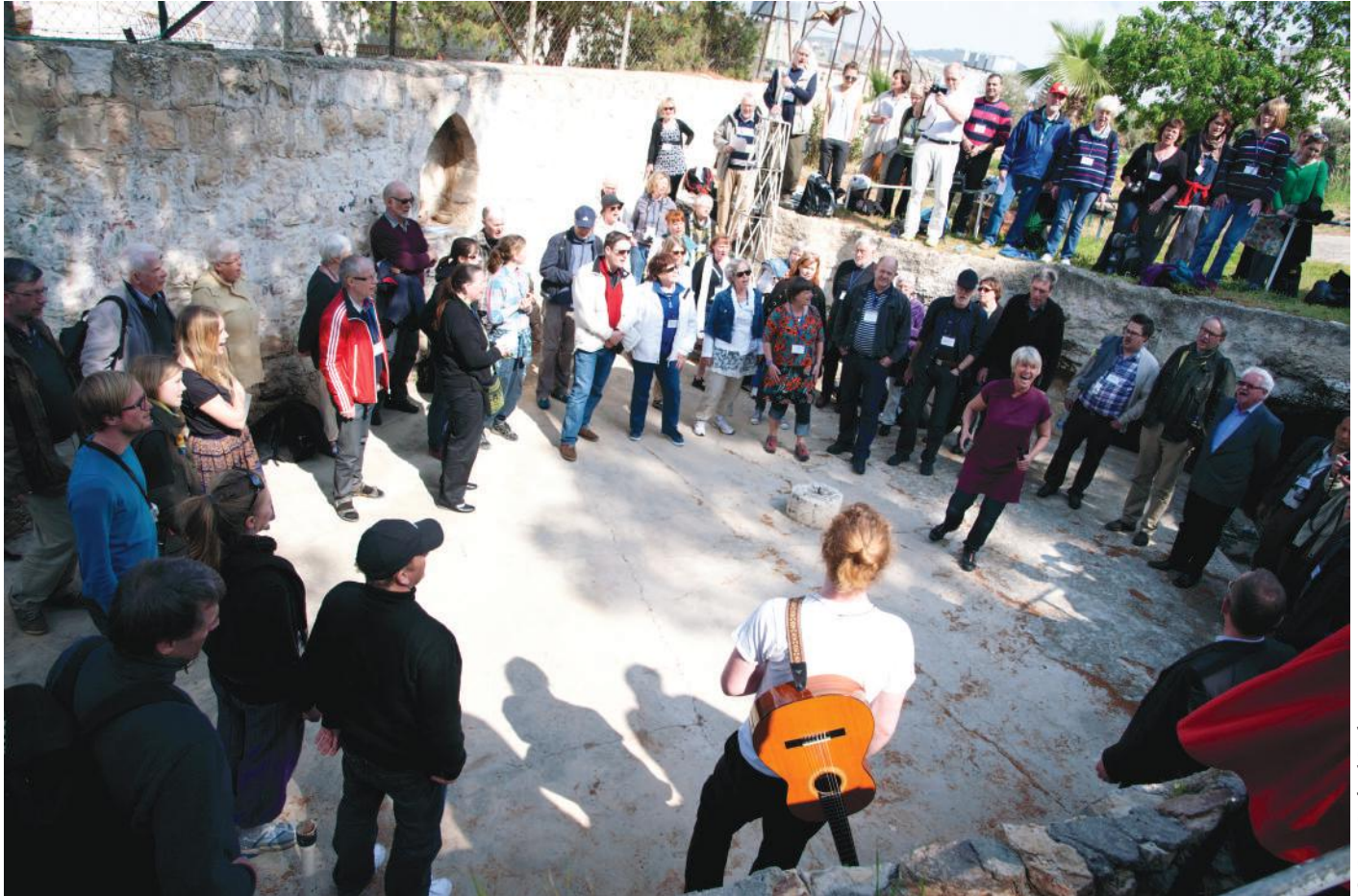
Worship at Shepherd's Field, Beit Sahour. Part of "Come and See" – Swedish Conference