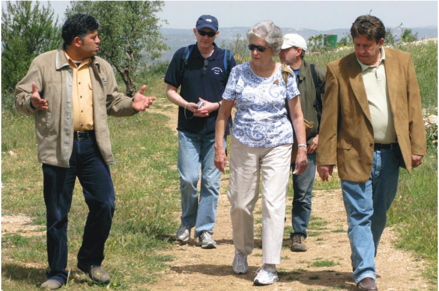
Witness Visit – Tent of Nations