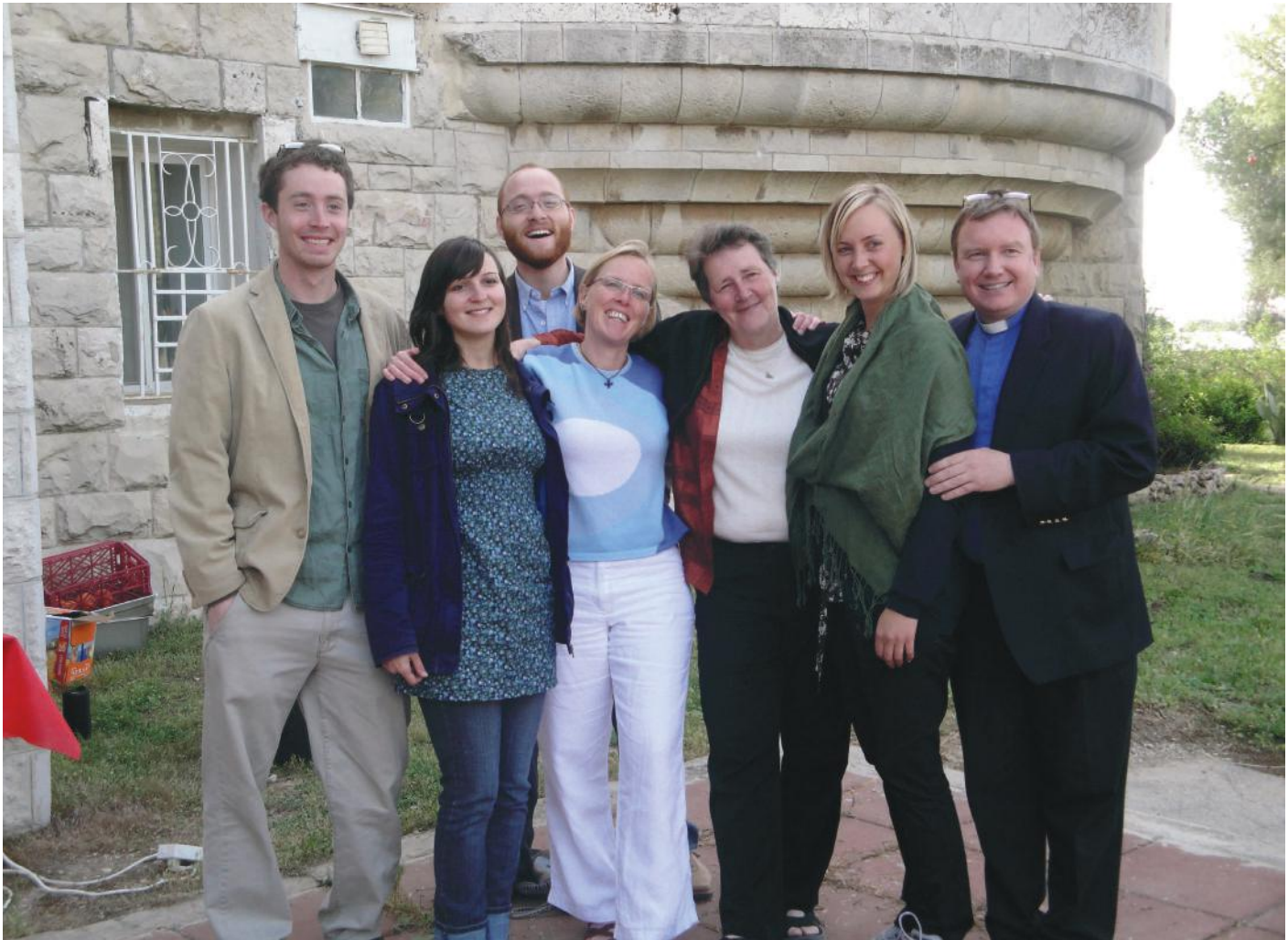
International friends working at Sabeel Jerusalem

Friends of Sabeel around the world and for their faithful commitment to works of peace and justice, the Palestinian people are tired of being “carried.” They want a life of independence and of dignity. And while the help of friends is needed and appreciated, they don’t want to continue this dependent existence; they want to be able to “pick up their mat and go home,” home to a state of their own.