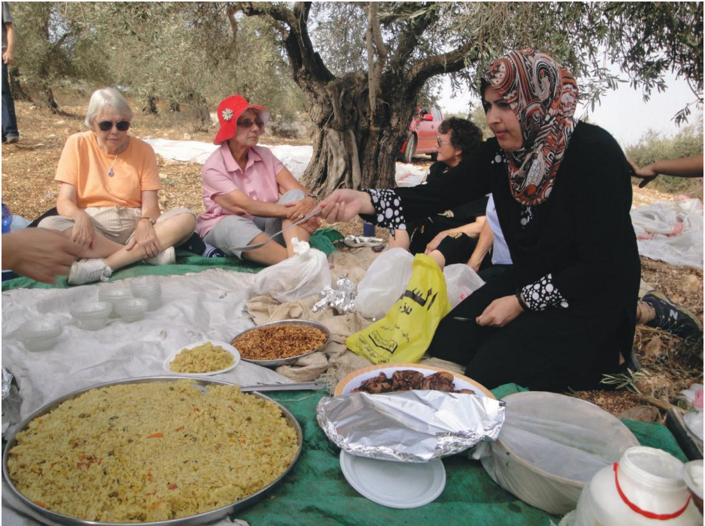
Witness Visit – Jenin olive harvest